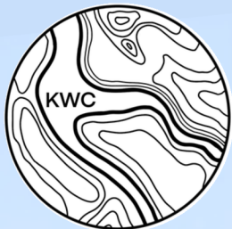
Kirsten Waugh Creations